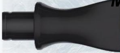
Middle Square Adapter

For reducing the skin temperature of middle square area, especially for hair removal treatment, such as Arm, underarm, leg.