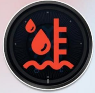
Water flow alarm