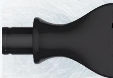
Large Square Adapter

For reducing the skin temperature of large treatment area, such as thigh, belly, especially for hair removal treatment.